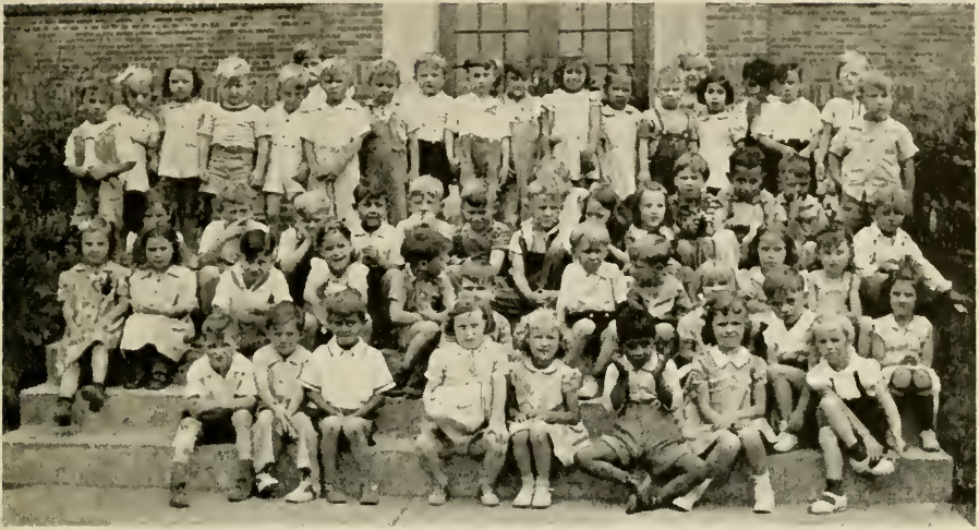
Kindergarteners of Lessie Bates Davis Neighborhood House, East St. Louis, Illinois